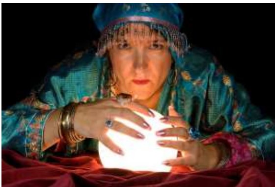
Fortune teller with a crystal ball

Interesting to note is that "funny magick" you see in comical sketches and cartoons have their origin in this occult venture, e.g. a fortune-teller sitting and telling you your fortune with a crystal ball & the evil witch looking into a mirror that divulges secrets etc.